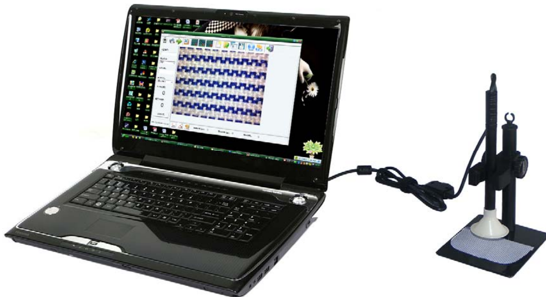
Camera with computer